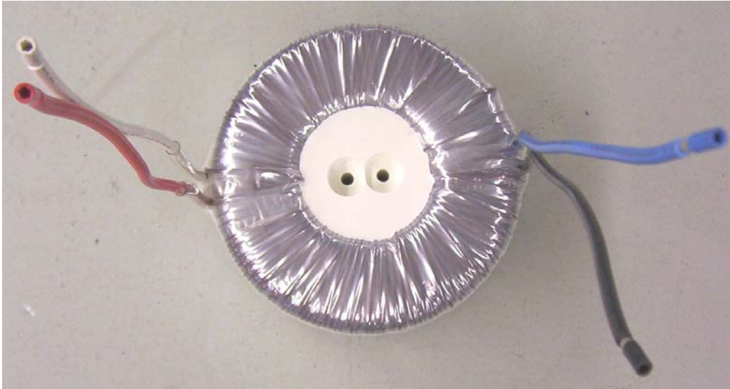
Figure 1: Top view of a sample transformer